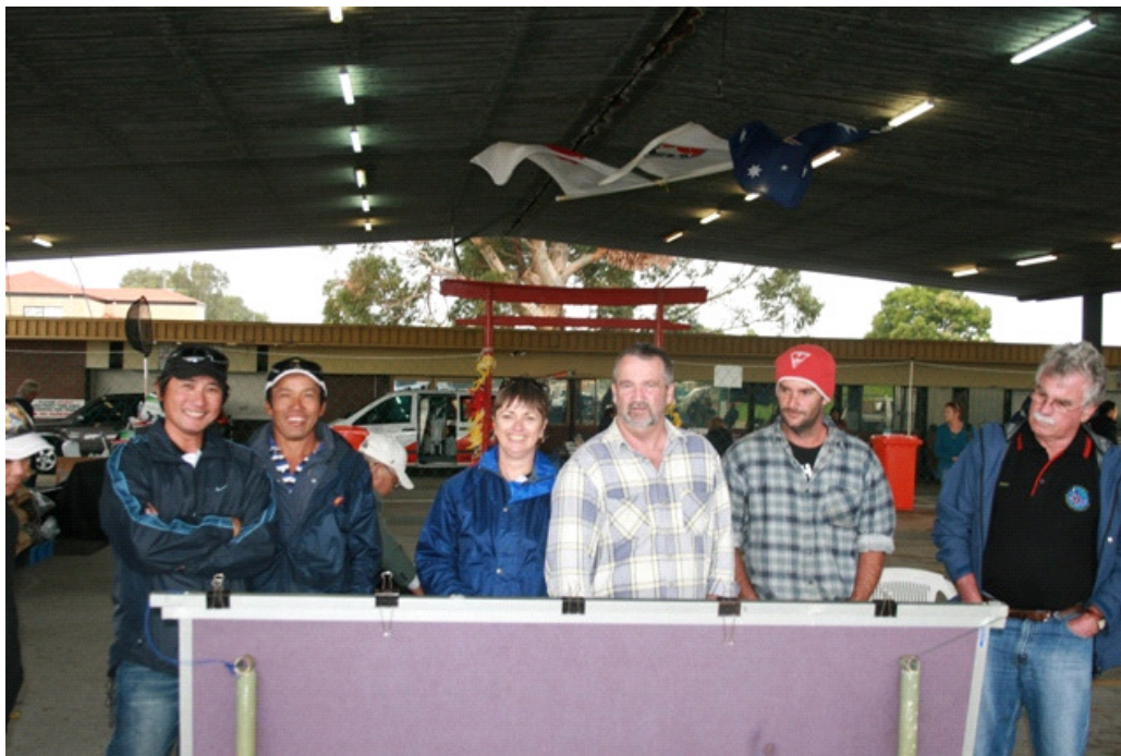
ABOVE: Exhibitors checking over the results board