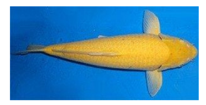
5. b) Which Show variety is it shown in?