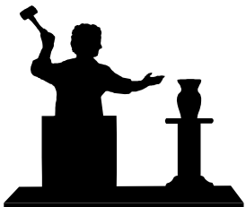
Table Show : Judge: Rodney Hansen

To people wanting to have fish for sale at the auction you will need to contact Urs to book a bin for your fish. No booking—No sale!