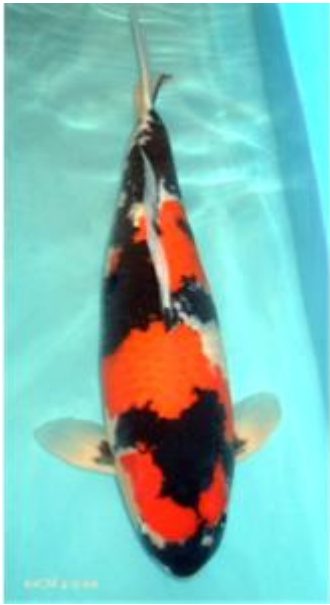
GRAND CHAMPION, ZNA TROPHY WINNER And AKA TROPHY WINNER