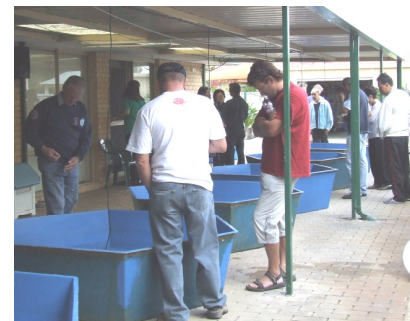
People starting to arrive and chose their new fish

It was a very nice afternoon with lots of people coming and happy buyers and sellers going home at the end of auction.