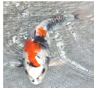
Two of the fish that were up for auction.