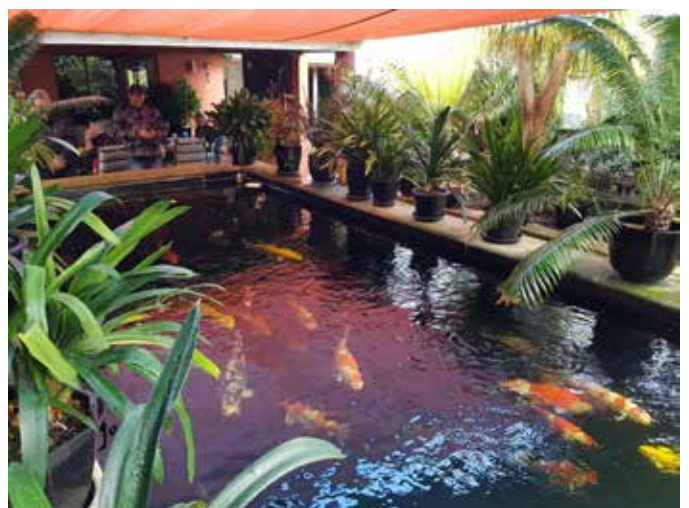
An array of koi in Allan's main pond