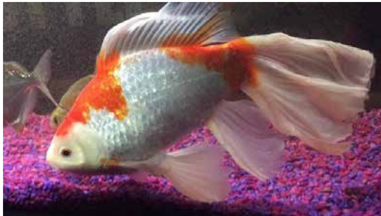
Above: 'Goldie'. Possible new world record holder.