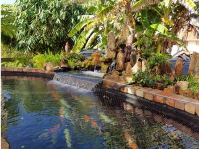
The waterfall and spillway at Sang's Pond