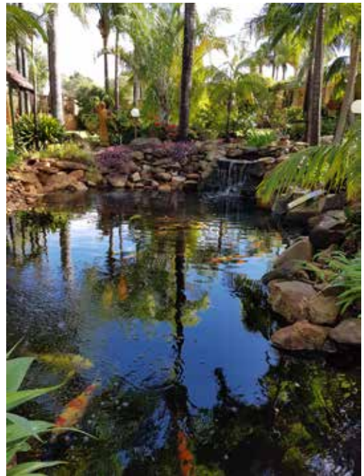
Outlook from the bridge over Dave's Pond