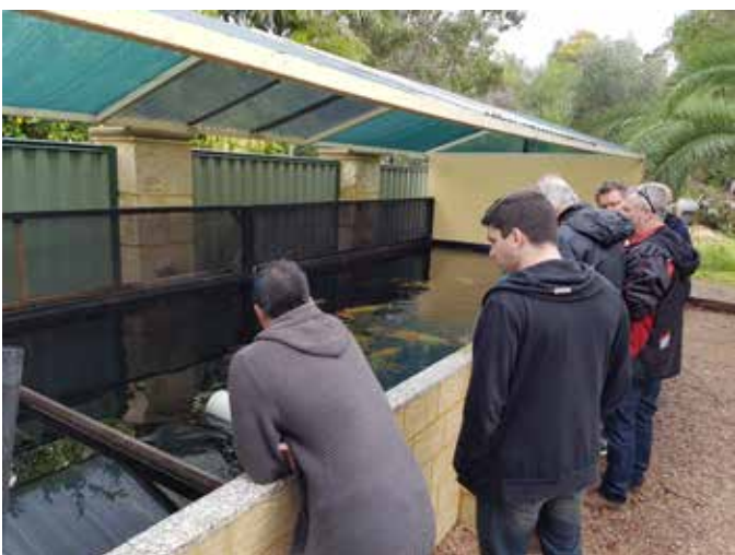
A look at the new flow through pond at Allan's