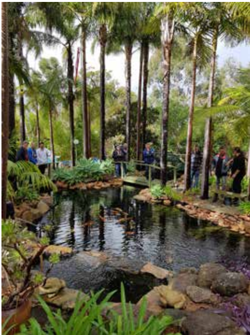
The crew admiring the view