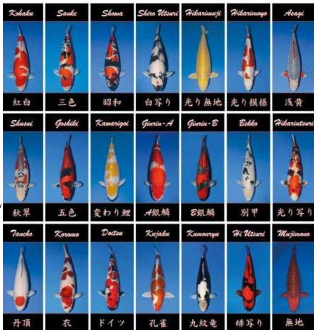
Above: The 21 recognised varieties of Koi

In 2016 the 21st variety, Mujimono, was introduced.