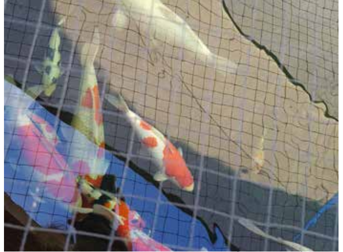
A group of koi in Sang's pond