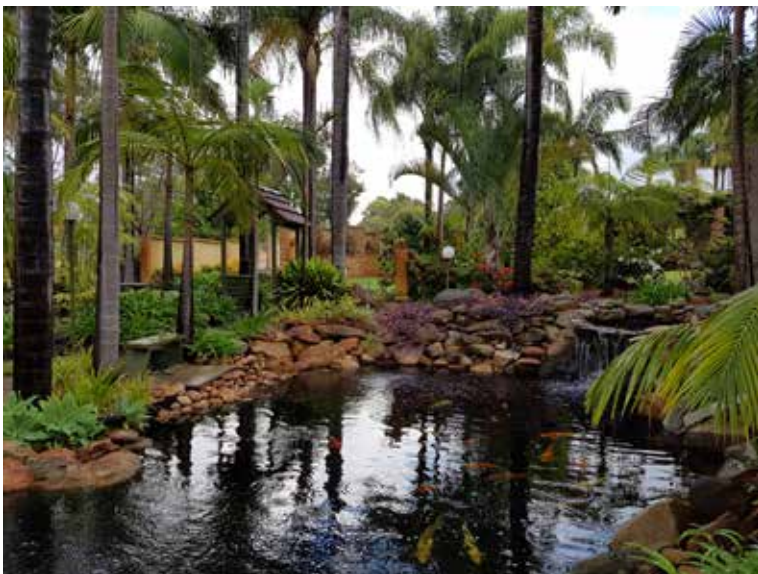
Above: A tropical oasis surrounds Dave's Pond

Next we headed north to Dave's semi-rural property which was a great space for a large natural type pond and expansive gardens. Surrounded by large palms and bordered by a rocky edge this pond sat beautifully in the landscape.