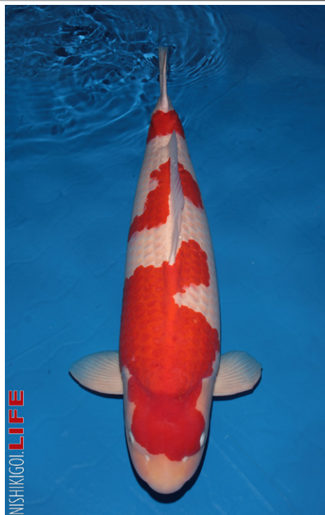
Grand Champion, Kohaku, 97cm, Bred by Marudo Koi Farm 2017 NIIGATA NOGYOSAI