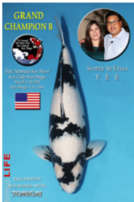
31ST ANNUAL SAN DIEGO KOI SHOW