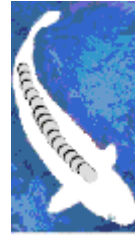
Doitsu ( German-scaled )

We've only covered a very few varieties of nishikigoi. There are so many more and some yet to be classified. Traditionalists consider Kohakus, Showas, Utsurimonos and Sankes to be the supreme varieties of nishikigoi. These opinions are reflected in judging at koi shows. Seldom is any other variety considered for a Grand Champion trophy. More often than not Grand Champions have regular scales but lately we're seeing that rule bend a bit. By changing the type scales and skin of the fish we can further classify these and other varieties.